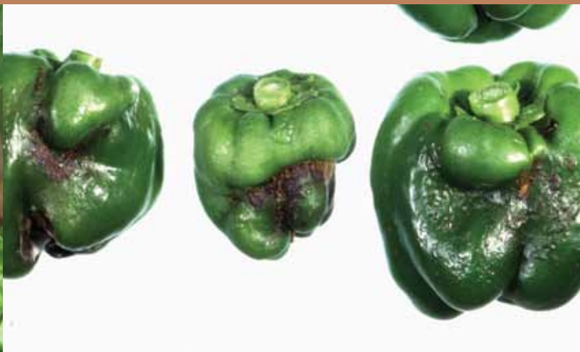
Distorted, unmarketable capsicum fruit from a plant infected by capsicum chlorosis virus

Thrips-proof netting or UV absorbing plastic provides a higher level of protection for seedling production.