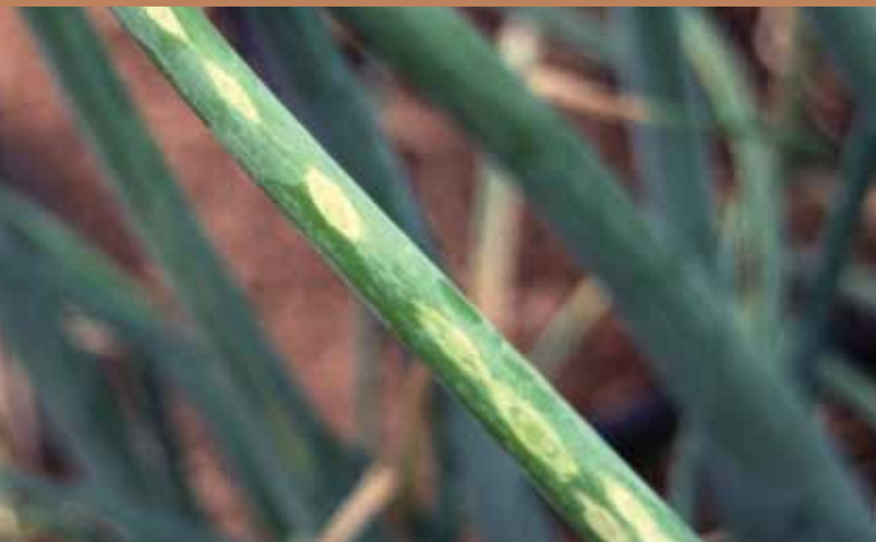
Iris yellow spot virus symptoms on onion