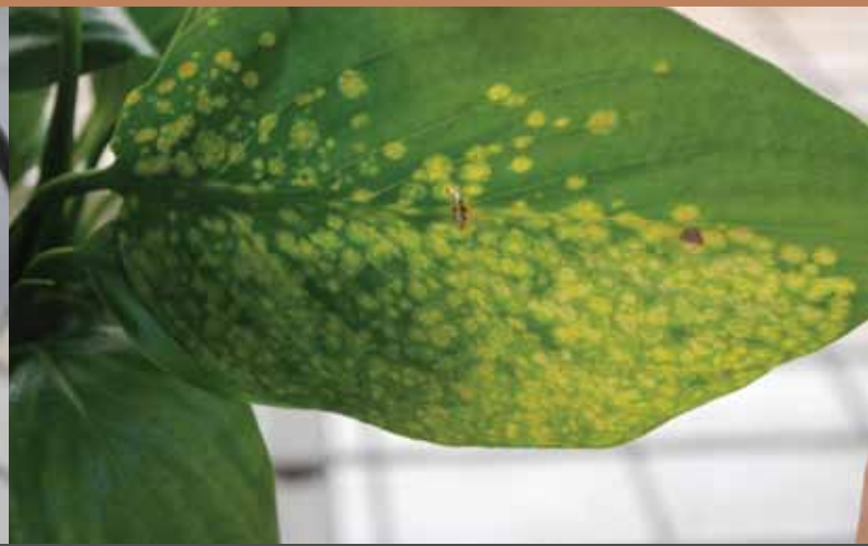
Impatiens necrotic spot virus symptoms on spathaphyllium

Hosts: The natural hosts of IYSV appear to be largely restricted to members of the Alliaceae family and include onion, garlic, leek, shallot and several species of ornamental plants.