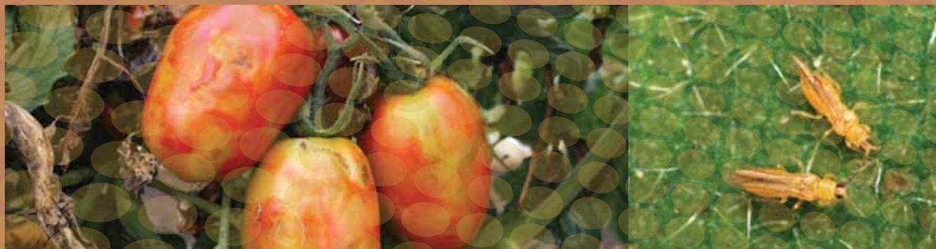
Tomato spotted wilt virus symptoms on tomato fruit