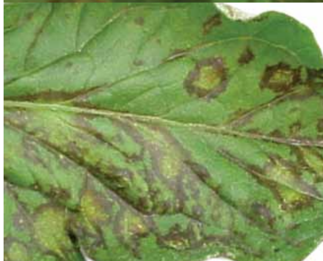
Tomato spotted wilt virus symptoms on tomato leaves