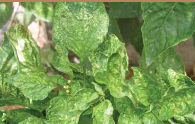
Tomato spotted wilt virus symptoms on capsicum