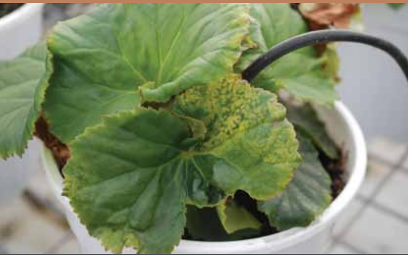
Impatiens necrotic spot virus symptoms on begonia