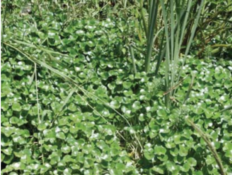
Figure 2. Growth habit of H. reniformis .