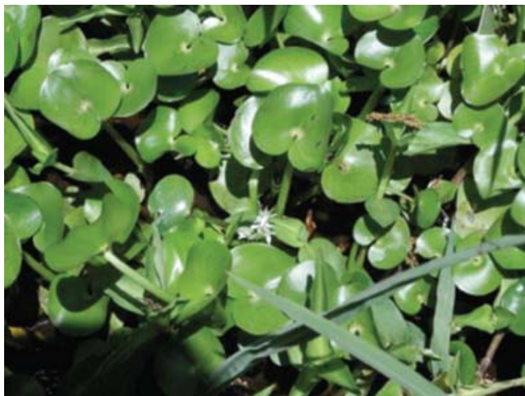
Figure 1. Leaves and flowers of H. reniformis .

H. reniformis is an annual or facultatively perennial plant, 20–50 cm tall, that grows in shallow, freshwater wetlands (Figures 1, 2 and 3). It can grow submerged or floating, with procumbent stems that either creep along the mud or float. The stems are wrapped in thick squamiform sheaths and produce roots at the nodes.