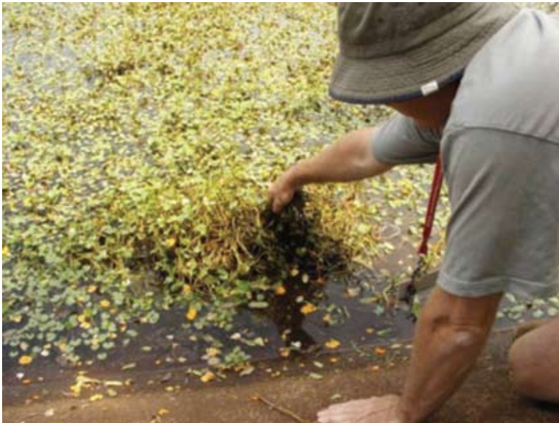
Figure 3. Mat-forming habit of H. reniformis growing in a shallow concrete drain.