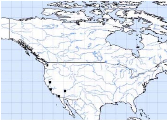
Figure 2. Herbaria records of Heterotheca grandiflora in North America.

H. grandiflora is native to an area of North America—from southern California south into north-west Mexico (Semple, 1993; Cronquist et al. 1994; GRIN, 2004; USDA, 2004) (Figures 2 and 3). It is naturalised in Arizona, Utah and Hawaii (Semple, 1993). The majority of specimens held by the Missouri Botanic Gardens are from California; however, a single specimen was collected from the Mohave Desert in Arizona (altitude 2797 feet), presumably a naturalised specimen.