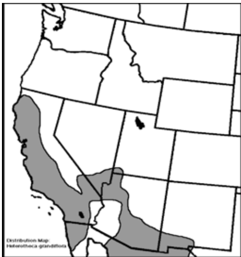
Figure 3. Distribution of Heterotheca grandiflora in North America.