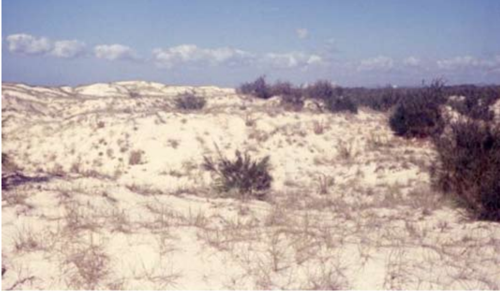
Figure 4. Open frontal dune complex on South Stradbroke Island: typical habitat type at risk of invasion by Heterotheca grandiflora on South Stradbroke Island.