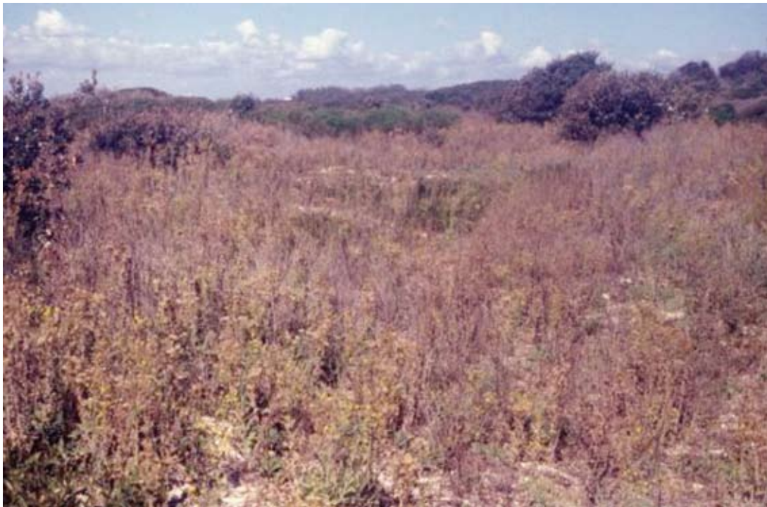
Figure 1. Open frontal dune on South Stradbroke Island that had been colonised by Heterotheca grandiflora (all the yellow-flowered plants and the dead, brown-coloured vegetation is H. grandiflora ). Photo taken in May 2004 just prior to successful control. This figure can be compared with Figure 4, which shows a nearby area that had not yet been invaded.

The only known infestations of H. grandiflora in Queensland occur at the northern end of the Gold Coast (including Wave-break Island and on the mainland at Paradise Point and Labrador) and on nearby South Stradbroke Island. The total area infested is estimated at some 200–300 ha. Prior to a successful control program over the last three years, the most extensive infestations previously existed along about 5000 m of frontal dunes running north-south along the southern end of South Stradbroke Island. Within this area, there used to be some pure stands of H. grandiflora (Figure 1). Other heavily infested sites on this island were near Couran Cove and near Tipplers (B. Whyte pers. comm., 2004). Currently, the species exists only as isolated specimens scattered across its former range.