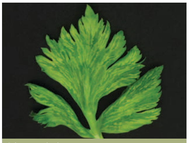
Celery mosaic virus.

Plant viruses are generally named after the first host in which they were found, though this may not give a true indication of the importance of the virus to that host.