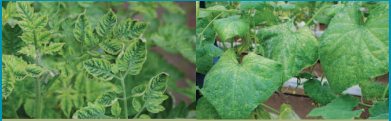
The silverleaf whitefly transmits Tomato yellow leaf curl virus ( left ). The greenhouse whitefly transmits Beet pseudoyellows virus (cucumber yellows).