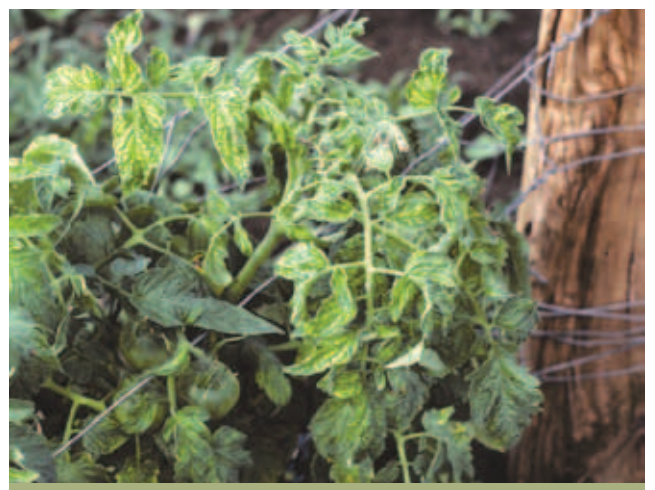
Tomato mosaic is easily spread by contact and on contaminated seed.

No single method is likely to provide perfect control. Nevertheless, by using a combination of the following management options disease control can be successfully implemented.